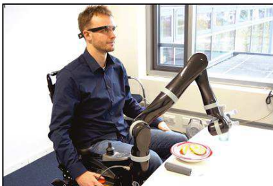
Figure 1 Scenario: User controls a robotic arm by head movements to eat and drink; Source: Own representation.

Acknowledgement Supported by the German Federal Ministry of Education and Research